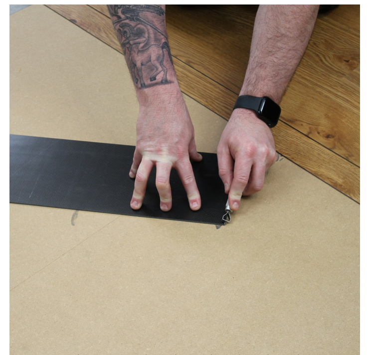
Removing the BUR and applying the micro bevel