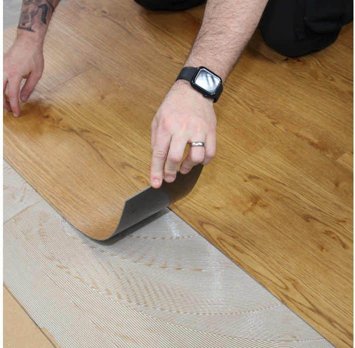
Applying the flooring into the adhesive