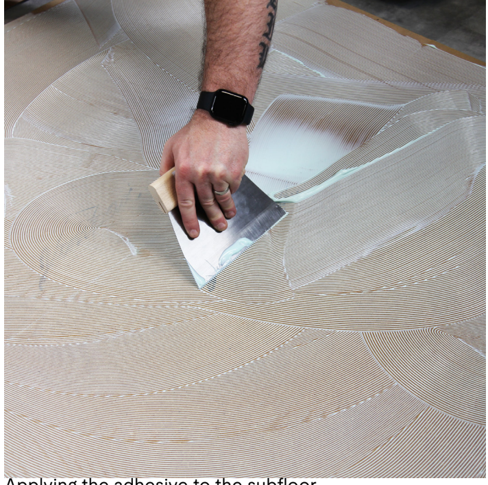
Applying the adhesive to the subfloor